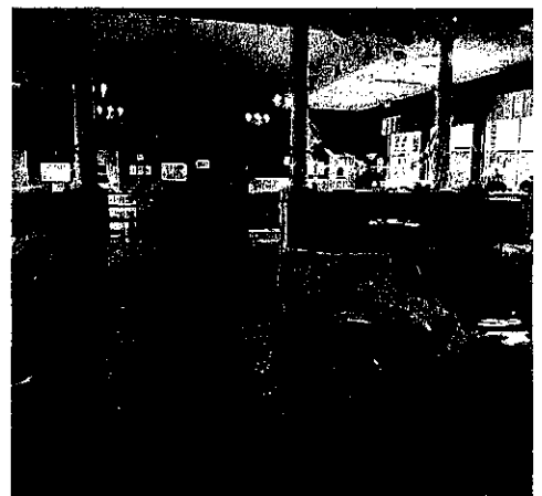
Water floods a Houston street (left) after Hurricane Harvey landed in late August. Hospitals and care centers, such as the Gulf Health Care Center in Port Arthur, Texas (above), worked to evacuate patients.